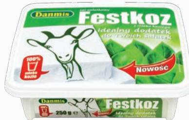
51. Salad cheese 250 g