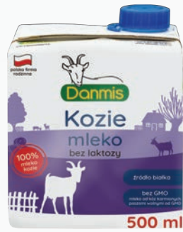
12. Milk without lactose 500 ml