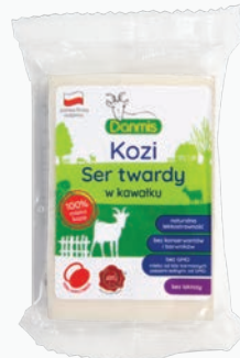
62. Hard cheese pieces 150 g