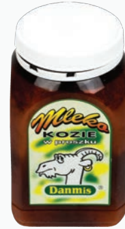
13. Milk powder 200 g