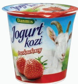
22. Yoghurt strawberry 125 ml