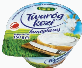
41. Fresh cheese 150 g