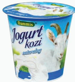
21. Yoghurt natural 125 ml