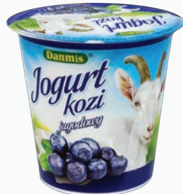
23. Yoghurt blueberry 125 ml