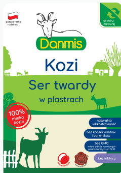
61. Hard cheese slices 100 g