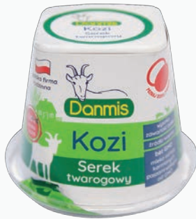
31. Cream fresh cheese 125 g