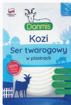
42. Fresh cheese in slices 150 g