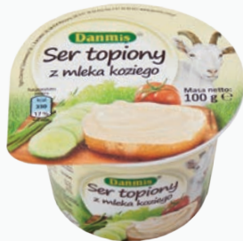
34. Processed cheese 100 g