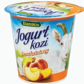
24. Yoghurt peach 125 ml