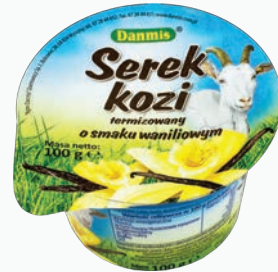
33. Cream cheese vanilla 100 g