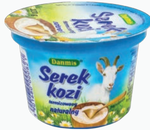
32. Cream cheese natural 100 g