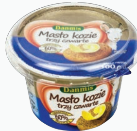
35. Butter fresh cheese mix 3/4 100 g