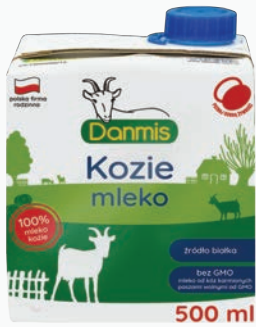
11. Milk 500 ml