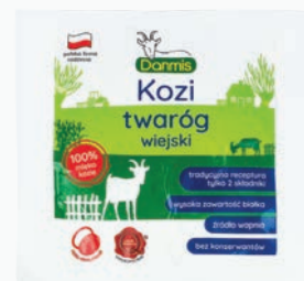
43. Fresh cheese traditional 200 g